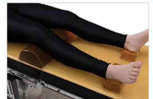
Shown with Heel Support and Overlay