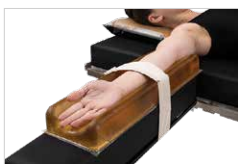
Shown with Stabilizer Strap