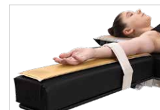
Shown with Stabilizer Strap