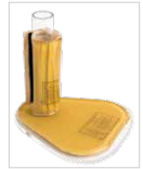
Shown with Post Pad