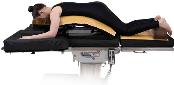
Shown above: Wilson Frame Pad Set on Action ® O.R. Performance Table Pads with Action ® Prone Headrest, Composite Contoured Armboard, Small Overlay, and Chest Roll