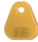
40707 Hip Pad w/ Post Hole

This oval shaped hip pad features an internal 1.75" hole to accommodate the perineal post. Pad is designed to protect the patient's upper leg and scrotum areas from skin injury due to pressure or shear forces during use.