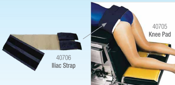
40705 Knee Pad