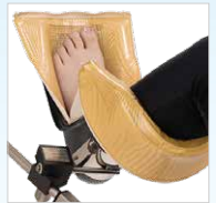
Shown with SAM Boot

Soft, reusable 1/4" thick polymer lithotomy boot liner designed to protect patient's lower leg and heel area by reducing pressure and shear.