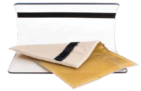
Hook and loop attachment