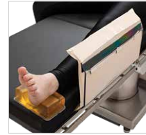
Shown with Heel Support