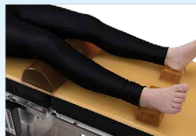
Shown with Heel Support and Overlay

40603L 20 L x 6 W x 3 H" 50.8 x 15 x 7.6 cm